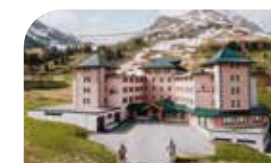
Hotel Alpenrose, Tel. +43 5239 / 5205