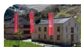
Restaurant Castello, Tel. +43 5239 / 520 181