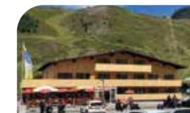
Sonne & Schnee, Tel. +43 5239 / 21 600