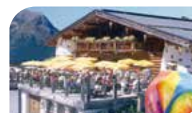
Kühtai Dorfstadt, Tel. +43 5239 / 5265