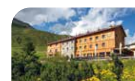
Dortmunder Hütte, Tel. +43 5239 / 52 02