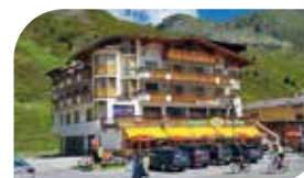
Kühtai Shop, Tel. +43 5239 / 52 70