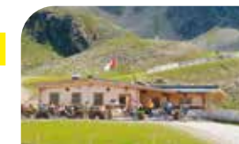
DreiSeen-Hütte, Tel. +43 5239 / 52 07