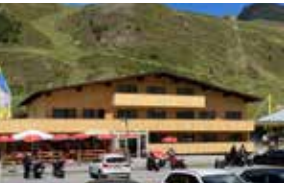
Sonne & Schnee, Tel. +435239 / 21 600