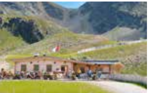
DreiSeen-Hut, Tel. +43 5239 / 52 07

Round off the intense experience of nature while hiking or biking with a hearty snack. Kühtai offers you opportunities in the village itself or on one of the huts. E.g. DreiSeen-Hut – 8 min. away from the mountain station.