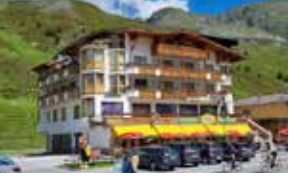
Kühtai Shop, Tel. +43 5239 / 52 70