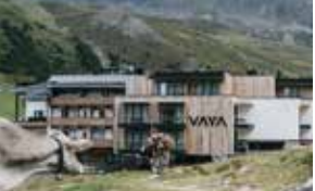
VAYA Kühtai, Tel. +43 5239 / 52 15