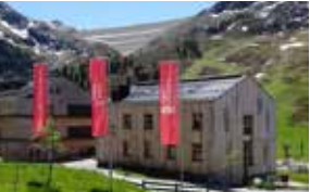
Pizzeria Castello, Tel. +43 5239 / 52 01 at 6:30 p.m

Kühtai is located in the middle of a botanical garden at an altitude of 2,020 meters. This alpine floral species, which covers the mountain slopes with its red splendour, blooms from mid-June to mid-July. Numerous hiking trails lead right past the colourful Alpine flowers, that not only delight the eye – the scent of alpine roses is in the already spicy mountain air! Along the slopes, dotted with pink and rusty red flowers, you can choose from comfortable walks and longer 1-to-3-hour hikes.