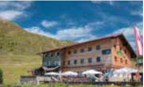
Dortmunder Hut, Tel. +43 5239 / 52 02