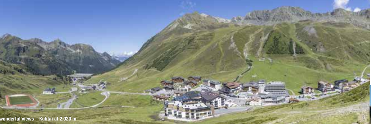
wonderful views – Kühtai at 2,020 m

The DreiSeenBahn cable car quickly takes you up to 2,410 m. From there, past the Upper Plenderlessee , you can reach on foot in just 8 minutes the Drei-Seen-Hut at 2,311 m, which is located directly on the Lower Plenderlessee . With sun terrace and large cooling playground. You then go back down via the middle of the Plenderlessee , on to the Hirschebensee (2,164 m), and back past the High Altitude Training Centre Kühtai to the valley station. Ascent 40 m / descent 470 m / 5.6 km / 2 h