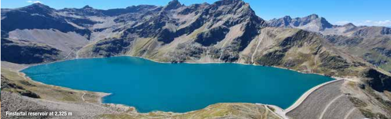
Finstertal reservoir at 2,325 m

Visiting the reservoirs in Kühtai is a special experience. It is fascinating to explore the huge dams and these large lakes with their turquoise shimmering waters. This is why the reservoirs have become really popular destinations. The Sellrain-Silz hydropower plant produces 100% clean electricity, covering about 13% of the total Tyrolean electricity demand.