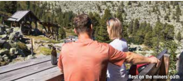
Rest on the miners' path