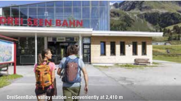
DreiSeenBahn valley station – conveniently at 2,410 m

The DreiSeen-Hut is also a good start for different mountain tours for example up to the Sulzkogel (3,016 m), the Gaiskogel (2,820 m) the Neunerkogel (2,640 m) or the Pockkogel (2,807 m) and many more. Starting from the DreiSeen-Hut to the Längentaler reservoir, passing the Finstertaler reservoir you can hike on the legendary Miner's Trail to the Knappenhaus in the Wörgle valley.