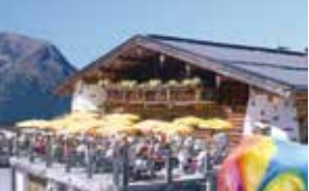
Kühtaler Dorfstadt, Tel. +43 5239 / 52 65