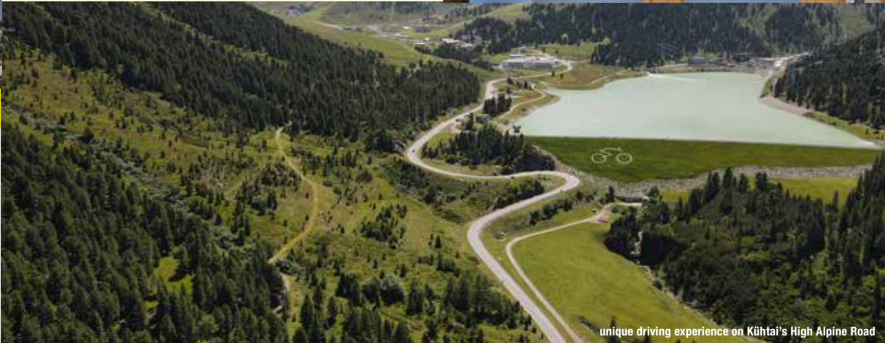
unique driving experience on Kühtai's High Alpine Road

On the way to Kühtai you will experience unique landscapes that change constantly with the altitude. The pass summit at 2,020 meters opens up the view of an overwhelming mountain world. On top of all this, it is toll and vignette-free! Whether by car, motorbike or sporty bike or mountain bike – the 50-kilometre-long High Alpine Road is always a special experience. Kühtai itself or charming places to stop for refreshments along the route invite you to linger. The impressive reservoirs are also easy to visit and provide unforgettable impressions. You can get from Innsbruck to Kühtai via Kematen in just 30 minutes, and into the Sellraintal valley through the mountaineering villages of Sellrain, Gries and St. Sigmund. Or you can get from Oetz into the Ötztal valley through the wild and romantic Nedertal valley. A variant with many views goes from Haiming to Ochsen Garten via Haimingerberg, from there, you can get on the mountain pass to Kühtai.