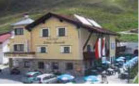
Schöne Aussicht, Tel. +43 5239 / 52 03