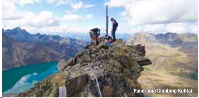
Panorama Climbing Kühtai

Slow-paced family hike around the Längental reservoir (unfortunately, due to the power plant construction site, this trail is not currently accessible throughout to people with disabilities). You can park at the free car park right by the reservoir. Ascent 38 m, 2.4 km, 45 min Variant: Start at the Kühtai Tourism Office (Tourismusbüro), head to the reservoir via the Kühtai village walk, walk around the reservoir, head back via the village walk.