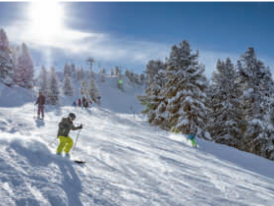
Fun on the slopes in Hochoetz