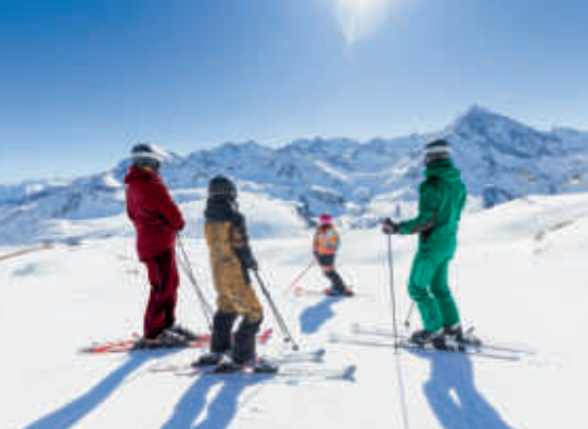
Lifting in Kühtai